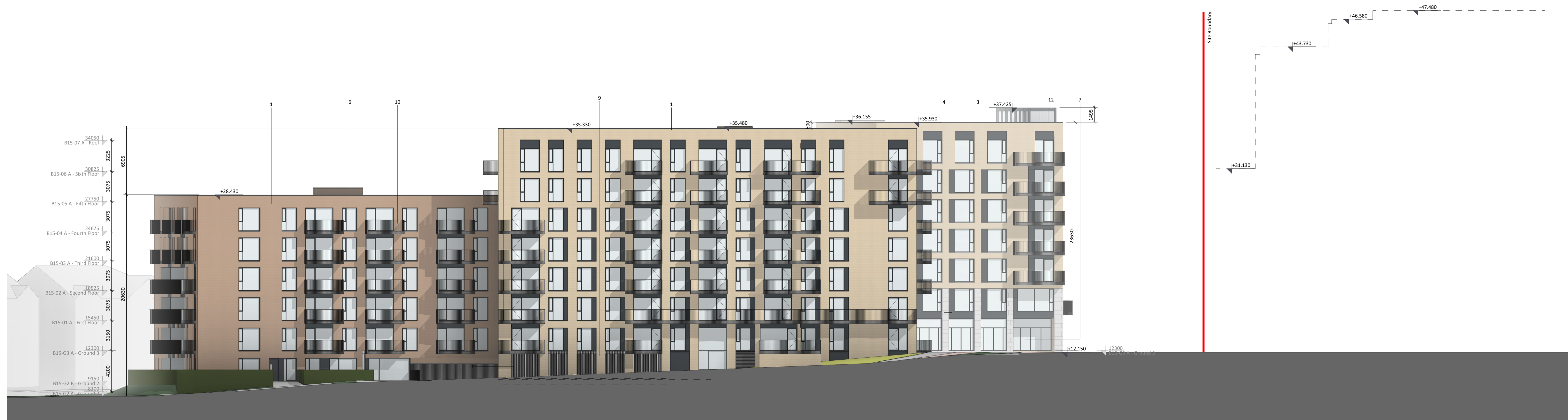
① B15-North East Elevation 1:200

Block 15, development subject to separate planning application ref: 22/40809