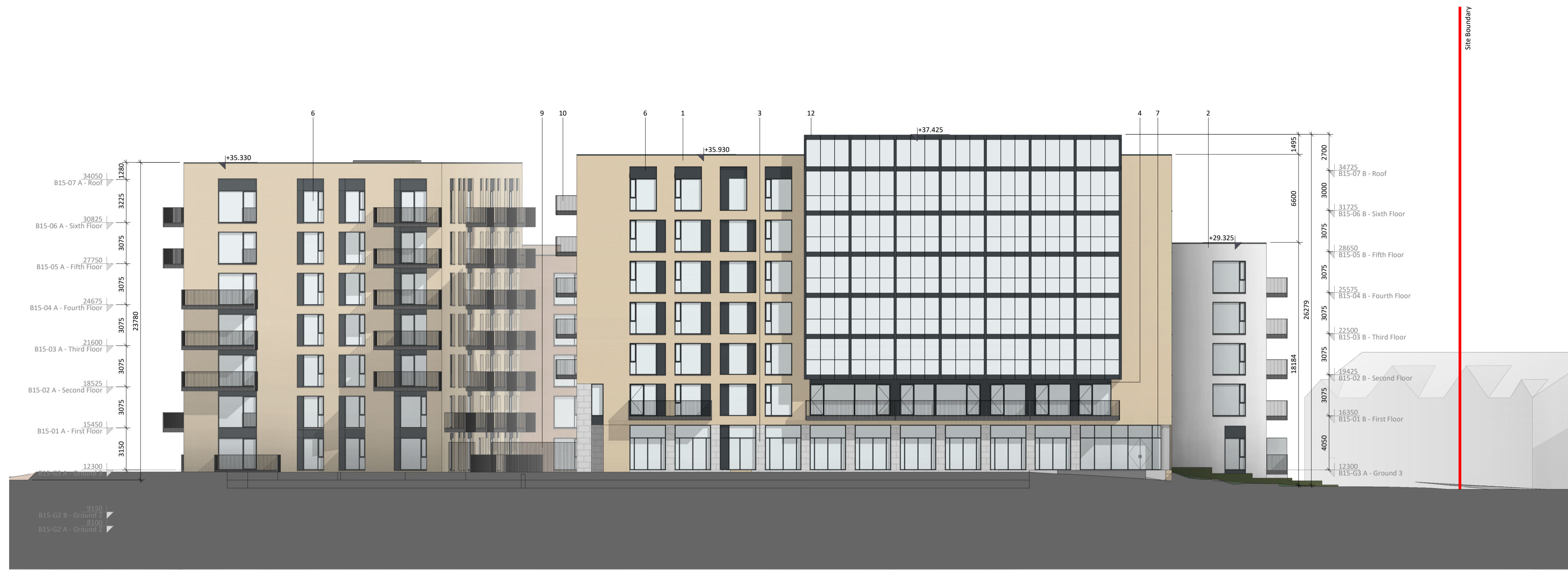
② B15-North West Elevation 1:200